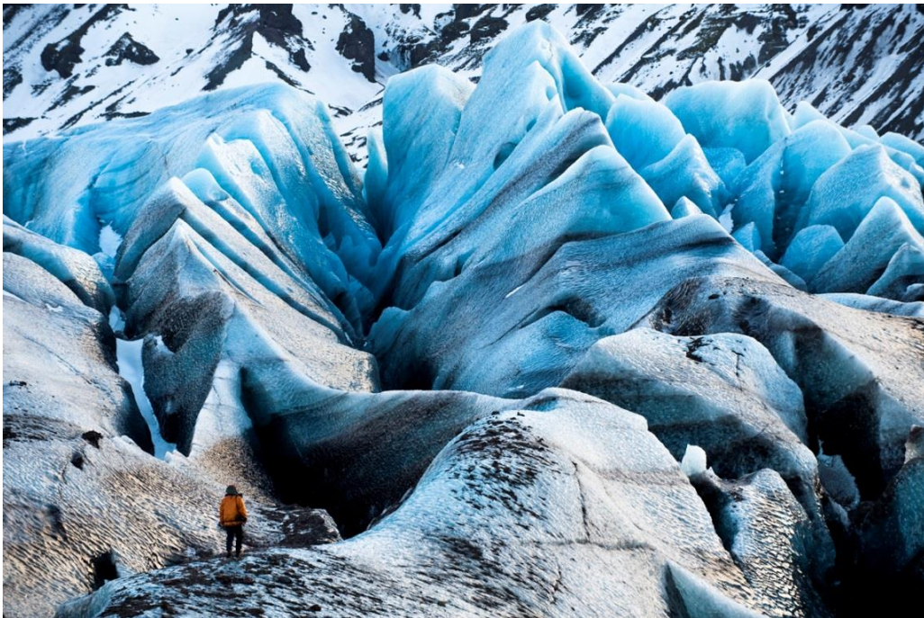
Art as a Scientific Process