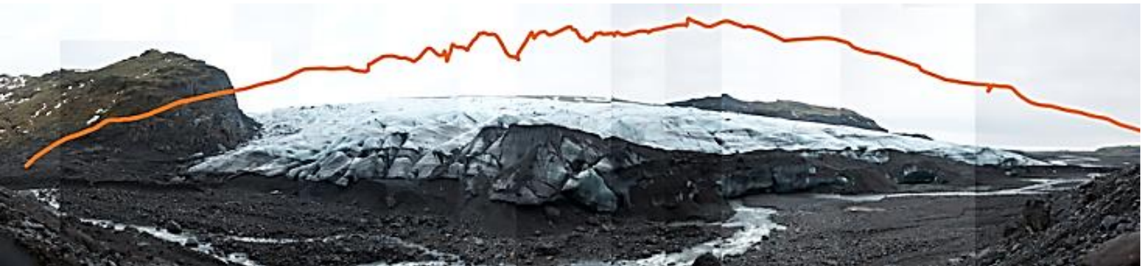
Solheim Glacier, Iceland as seen from James Balog's "Waypoint 11," October 2006, six months later.

Weather – The changes we see in the atmosphere, usually described by temperature, wind, and precipitation over a period of hours and days.